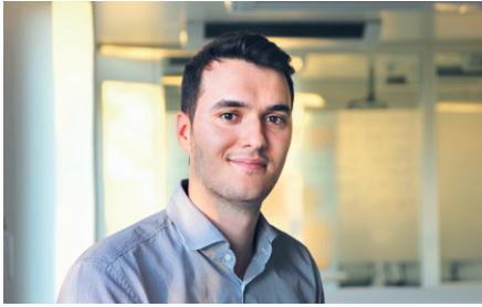
Baton Shala identified and assessed more than 100 economic smart city applications.